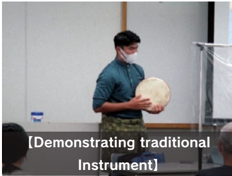
[Demonstrating traditional Instrument]

The International Understanding Classes by Foreign Residents in Kagoshima Prefecture invites foreign residents to introduce their mother country's culture and help promote multicultural coexistence.