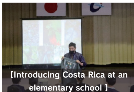
[Introducing Costa Rica at an elementary school]

Every year, 3 groups, the Supporting Organisation of Japan Overseas Cooperation Volunteers (hereinafter called JOCV) in Kagoshima, the JOCV Kagoshima Alumni Association, and the Kagoshima International Association, hold a joint project that sees JOCV returnees and international students living in Kagoshima Prefecture dispatched as lecturers to around 40 elementary and junior high schools.