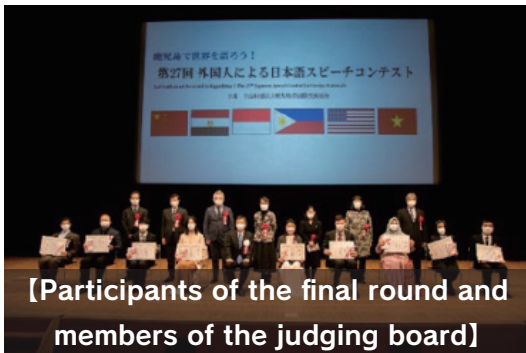
[Participants of the final round and members of the judging board]

On 29 January, the final of this year's Japanese Speech Contest was held. A total of 22 foreign nationals living in Kagoshima Prefecture from 10 countries applied, and after a preliminary round 9 participants from 6 countries were chosen to present their speeches in the final round.