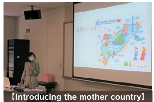
[Introducing the mother country]

In each lecture, the instructor introduced their home country in a fun, humorous manner, deepening the understanding of participants in a peaceful atmosphere. Comments made by participants such as "I gained an interest in different cultures," "I wanted to try going once!" and "I'm so happy to have learnt many things I didn't know before," show how participants were able to have fun whilst deepening their understanding of different areas. We look forward to the next time we can serve as a place for exchange and mutual understanding between prefectural citizens and foreign citizens residing in the area.