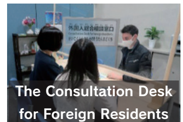
The Consultation Desk for Foreign Residents