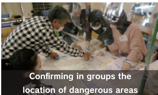
Confirming in groups the location of dangerous areas

The seminar on 'Support for Foreign Residents on Disaster Prevention Measures' was held for a total of 4 sessions from October to November. It was targeted towards foreign residents living in Satsuma Town and the surrounding Satsuma area, with Satsuma Town co-hosting the event. Overall, 29 Japanese participants and 25 foreign residents participated in the courses.