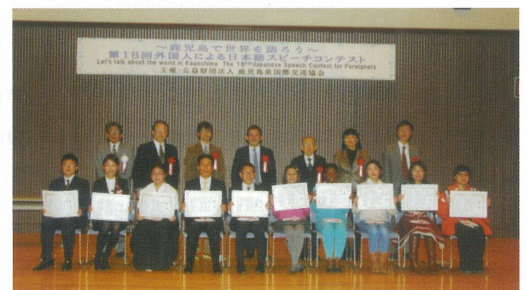
《The finalists (front) and judges (back)》

Making a speech in a foreign language before an audience is a feat that requires much courage, and the ten finalists accomplished this feat with much confidence and vigor. We hope the speech contest participants would go on to become bridges to link their home country / region and Kagoshima in the future.