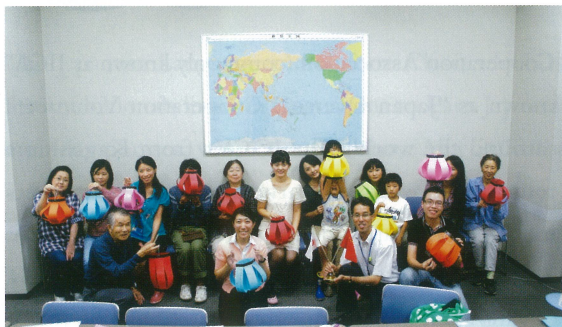
《Handmade Paper Lanterns》

To commemorate the 40 th anniversary of normalized diplomatic relations between China and Japan this year, photo panels and other materials introducing the lifestyle in China and Kagoshima's connections with the country were displayed at the international exchange plaza from September 22 to October 6, 2012. During this time, many guests came to see the “China-Japan 40 Year Friendship Anniversary Photo Contest” sponsored by the Japan-China Friendship Association of Kagoshima (prefectural) and the Kagoshima Japan-China Friendship Association (municipal) as well as commemorative items and a panel display explaining all exchange activities and friendship agreements with cities and provinces in China. The first day featured a performance of traditional Chinese dance and musical