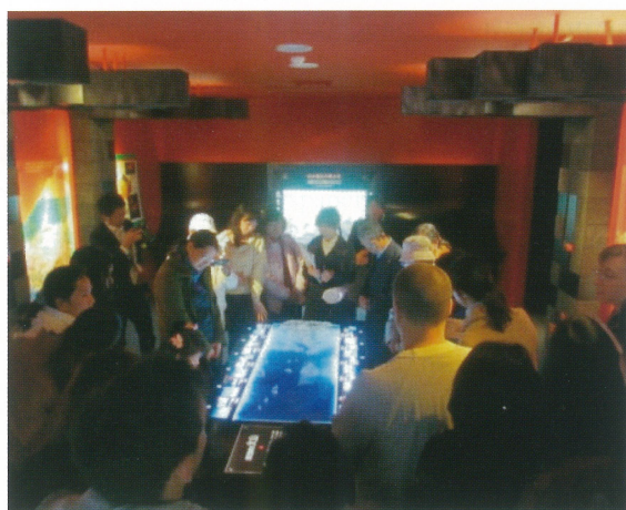
《Participants learned the locations of volcanoes in Kagoshima》

This year, the Kagoshima International Association organized the “Disaster Preparedness Class for Non-Japanese Residents” at the Kagoshima Prefectural Disaster Prevention Training Center in Aira City.