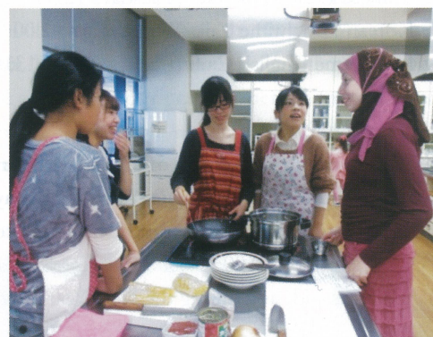
《Making Egyptian food “Kushari”》

Participants happily commented “It was really fun learning about the country, including making food and trying on the ethnic clothing,” and “I realized that my previous knowledge of Egypt was very superficial and decided that from now on I want to study more in-depth.” Kushari is an Egyptian dish made with macaroni, chickpeas, lentils, and rice topped with tomato sauce and fried onion. This inexpensive food enjoys popularity all over the country. It’s a rather filling dish, so the participants in the class said they went home stuffed full of food and totally satisfied. Instructors for the two seminars created a comfortable “at home” atmosphere during class.