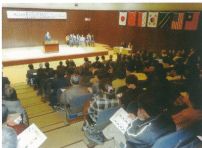
《There was a large audience!》