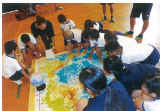
《Kurokami Elementary School》

The Japan International Cooperation Association (commonly known as JICA) dispatches volunteers, known as “Japan Overseas Cooperation Volunteers (JOCV)”, to countries around the world. The JOCVs from Kagoshima prefecture, upon their return from overseas, participate as guest speakers in the “JOCV Alumni and International Students as Teachers” school visit program jointly organized by the Kagoshima International Association (KIA), The Supporting Organization of JOCV in Kagoshima, and the JOCV Kagoshima Alumni Association. This program dispatches speakers to over 40 elementary and junior high schools in Kagoshima prefecture per year and since its inauguration in 1995, the guest speakers have visited more than 700 schools in the prefecture.