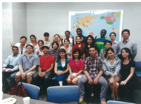
《A group photo after class》

Through the year of study, the participants deepened their interest in both the language and culture of Japan.