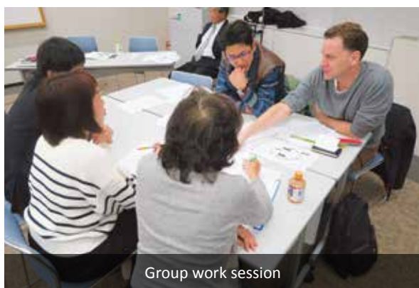
Group work session

On 17 December 2017, Kagoshima International Association (KIA) organized a study group for volunteer interpreters and staff of medical institutions to learn about the difficulties faced by foreigners when they visit a medical institution. 31 people attended the workshop.