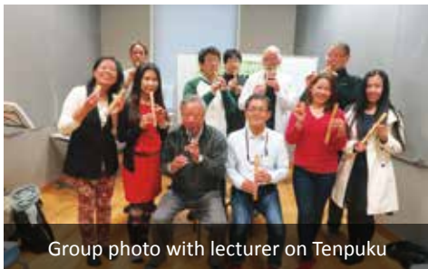
Group photo with lecturer on Tenpuku

The Japanese Language Chat Room, for foreigners with a grasp of conversational Japanese, was held between May 2017 and March 2018 for a total of 20 sessions.