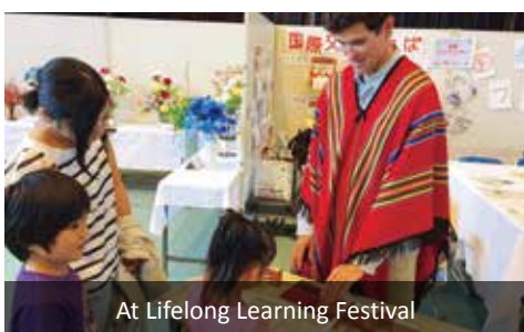
At Lifelong Learning Festival

This initiative aims to stimulate interest in international exchange through the setting up of international exchange booths at local festivals with the cooperation of foreign residents and international exchange organizations. This fiscal year, KIA has participated in the MBC Summer Festival in Kagoshima City, the Koyama Yabusame Festival in Kimotsuki Town, the Lifelong Learning Festival in China Town, and the Marugoto Ijuin Festival in Hioki City.