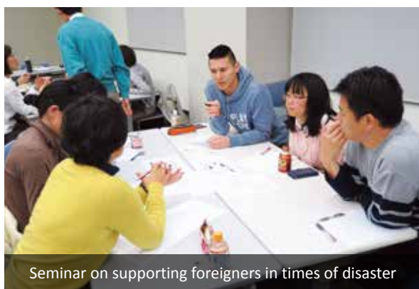
Seminar on supporting foreigners in times of disaster