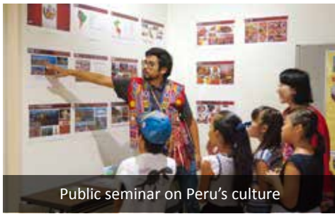
Public seminar on Peru's culture

This fiscal year, KIA organized public seminars on international understanding on Peru and Islam, which are led by foreigners residing in Kagoshima who make use of the opportunity to introduce their home culture to the locals.