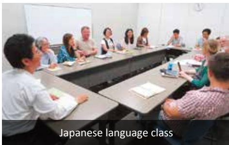
Japanese language class

The Japanese Language and Culture Class was held from May 2017 to February 2018 to teach foreigners living in Kagoshima about Japanese customs and useful everyday phrases. The Tuesday and Thursday classes each met 30 times for a combined total of 60 sessions.