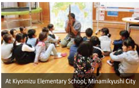
At Kiyomizu Elementary School, Minamikyushu City

This school visit program is jointly organized by KIA, the Supporting Organization of Japan Overseas Cooperation Volunteers (JOCV) in Kagoshima, and the JOCV Kagoshima Alumni Association. The program dispatches returnee JOCVs and international students to over 40 schools every year, and since its inauguration in 1995 the guest speakers have visited more than 910 elementary and junior high schools in the prefecture. The program began dispatching speakers to special needs schools from 2016.