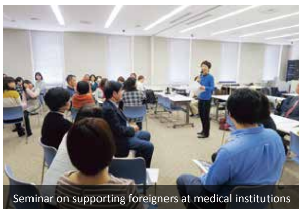
Seminar on supporting foreigners at medical institutions